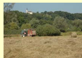
Maintenance of wet meadows (mowing after 15th July on 100 ha and cleaning of 65 ha of overgrown meadows)

Jovsi - one of the most beautiful landscapes in Slovenia attained its beauty due to the hundreds of years of coexistence of people with nature. We want to keep it for future generations.