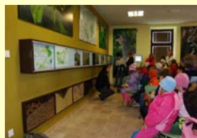
Information centre in Kapele Village