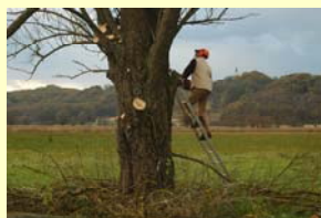
Traditional pruning of White Willow trees