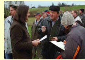
Informing of local inhabitants, farmers and landowners