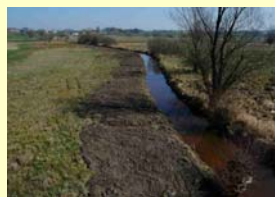
Improvement of hydrological conditions along the Šica stream