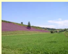
Land buying → one owner