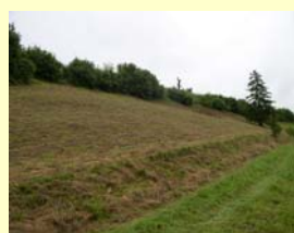
Mowing the grassland (every year in late summer)