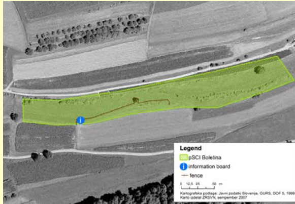
Legend pSCI Boletina information board fence 0 12.5 25 50 m Kartografska podjetje, Javni podatki Slovenije, GURS, DOF 5, 1999 Karti izdelal ZRSVN, september 2007