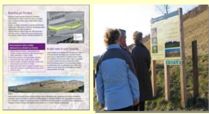
Public awareness campaign