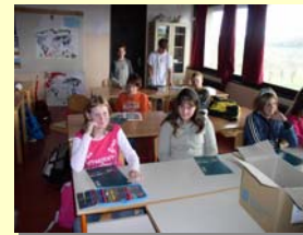
Educational programme (local residents including pupils)