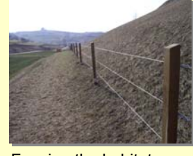
Fencing the habitat