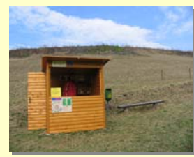
Supervision during the blooming season