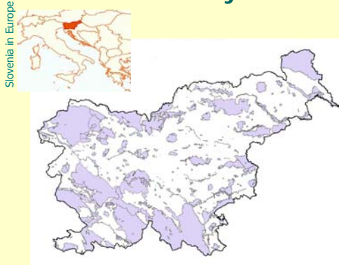
Natura 2000 sites in Slovenia

The LIFE* project »Natura 2000 in Slovenia – management models and information system«, whose beneficiary is the Institute of the Republic of Slovenia for Nature Conservation, is dedicated to a systematic solving of the questions associated with effective and sustainable management of Natura 2000 sites in Slovenia. Within the project's framework, five pilot Natura sites have been selected where various activities are carried out in order to solve various nature-conservancy issues.